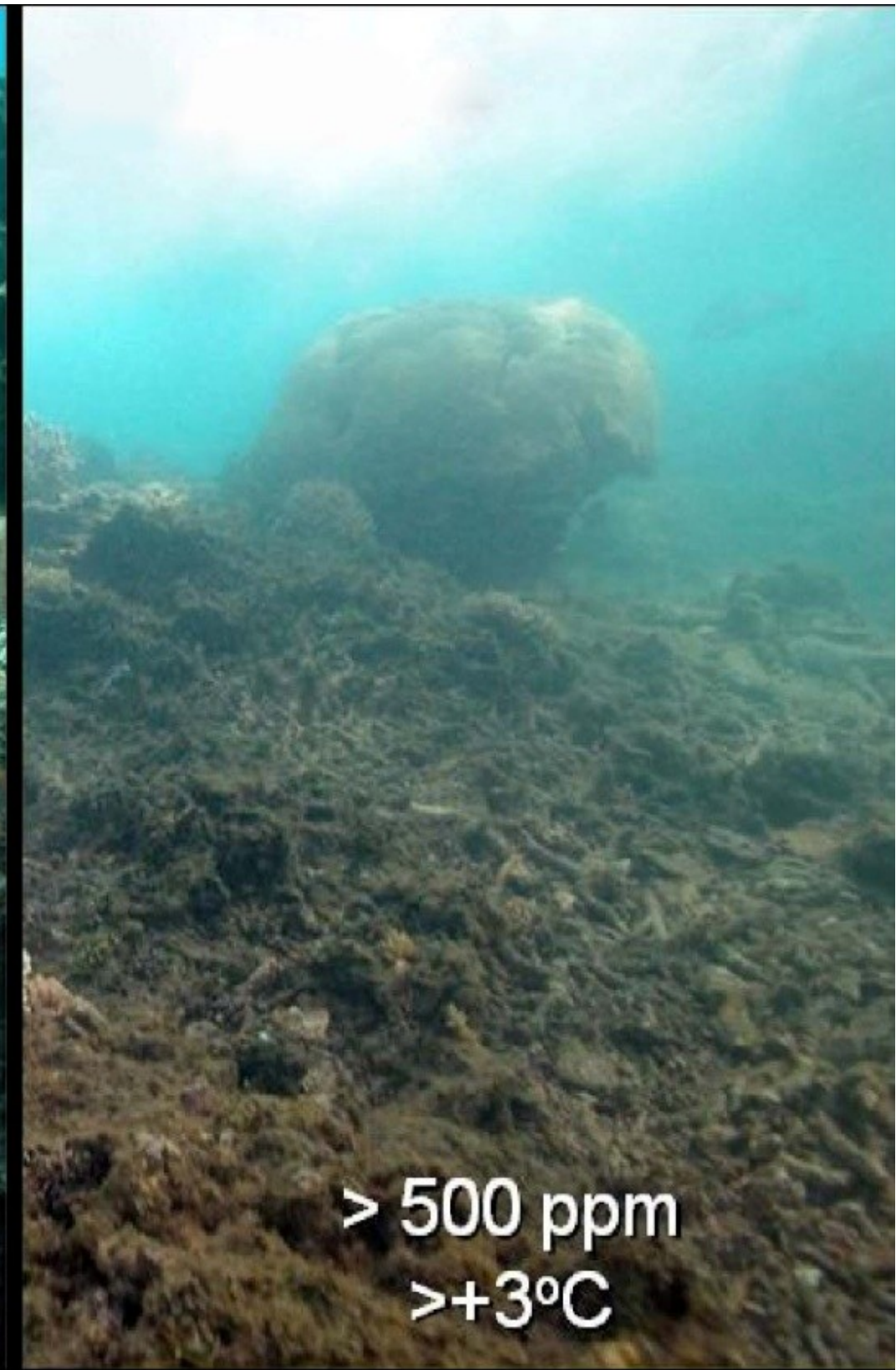
Increasing CO 2 levels in the oceans increases ocean acidity and ocean temperature. This erodes coral and has a profound effect on sea-life.